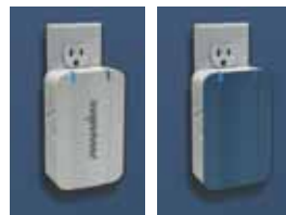
Front cover can easily be removed & painted to match any wall color.